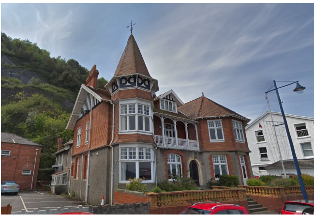
Bristol Channel Yacht Club (grade II listed building)