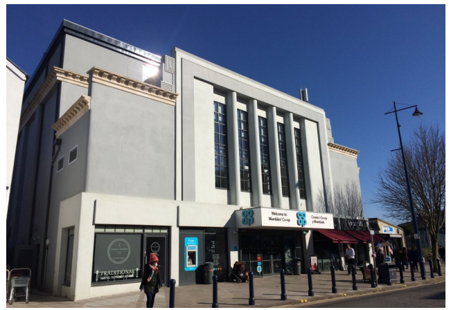
Oyster Wharf, Mumbles Road facing elevation (above) and seafront facing elevation (below)