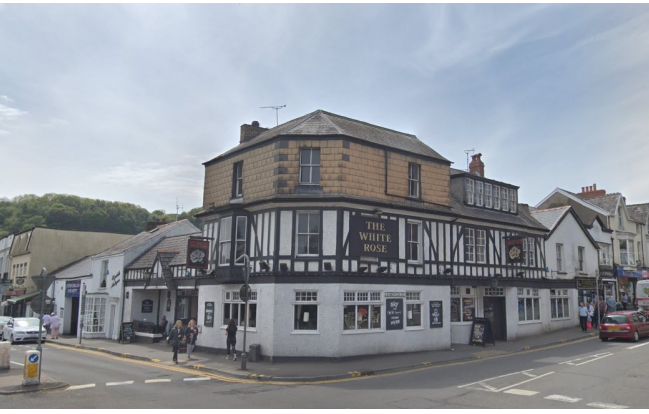
The White Rose Inn on the junction of Mumbles Road &