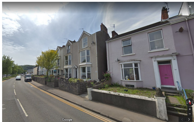
Northern approach buildings into the seafront character area with differing scale and linked frontage overlooking Swansea Bay

5.2.8 There are few negative buildings which are of inappropriate scale, materials, design or massing and create a negative effect on the historic character of the Conservation Area. The outstanding examples are: