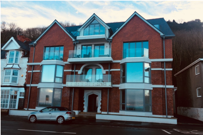
Recently converted and extended Conservative Club, 672