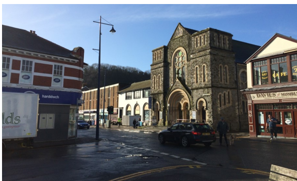
The Dunns with the Methodist Church and commercial unit opposite on Mumbles Road